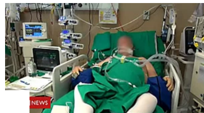
What exactly happens in an intensive care unit?