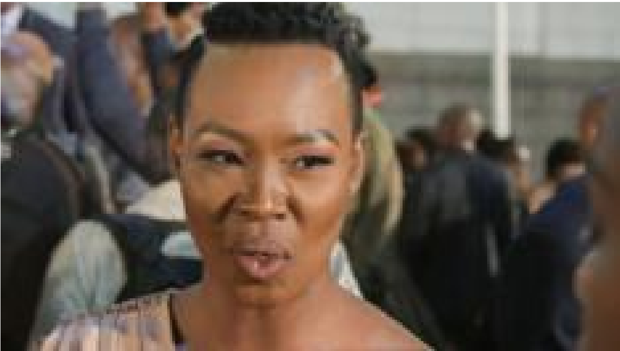
SA minister suspended for breaking lockdown rules