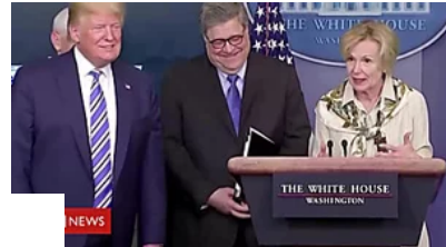
'Uh oh' - Trump backs away as official says she had fever