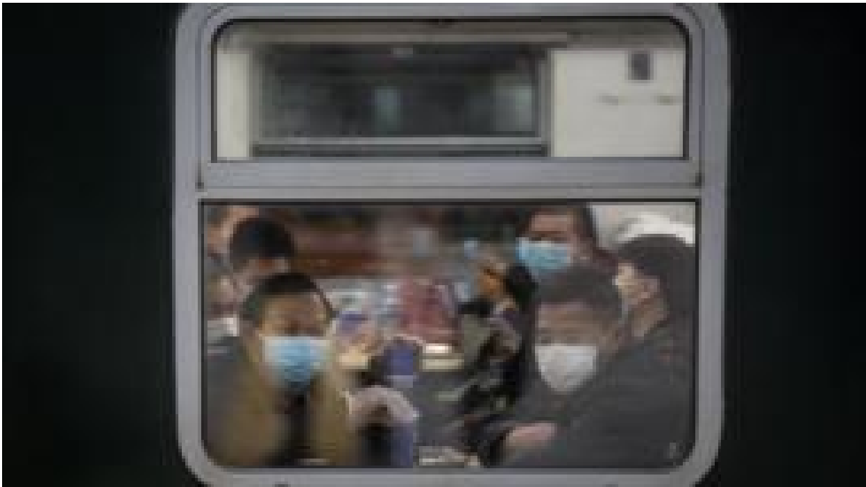
A dazed city emerges from the harshest of lockdowns