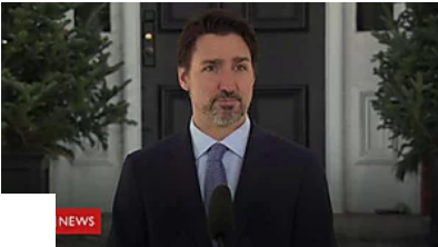
Trudeau grabs coat during live press briefing