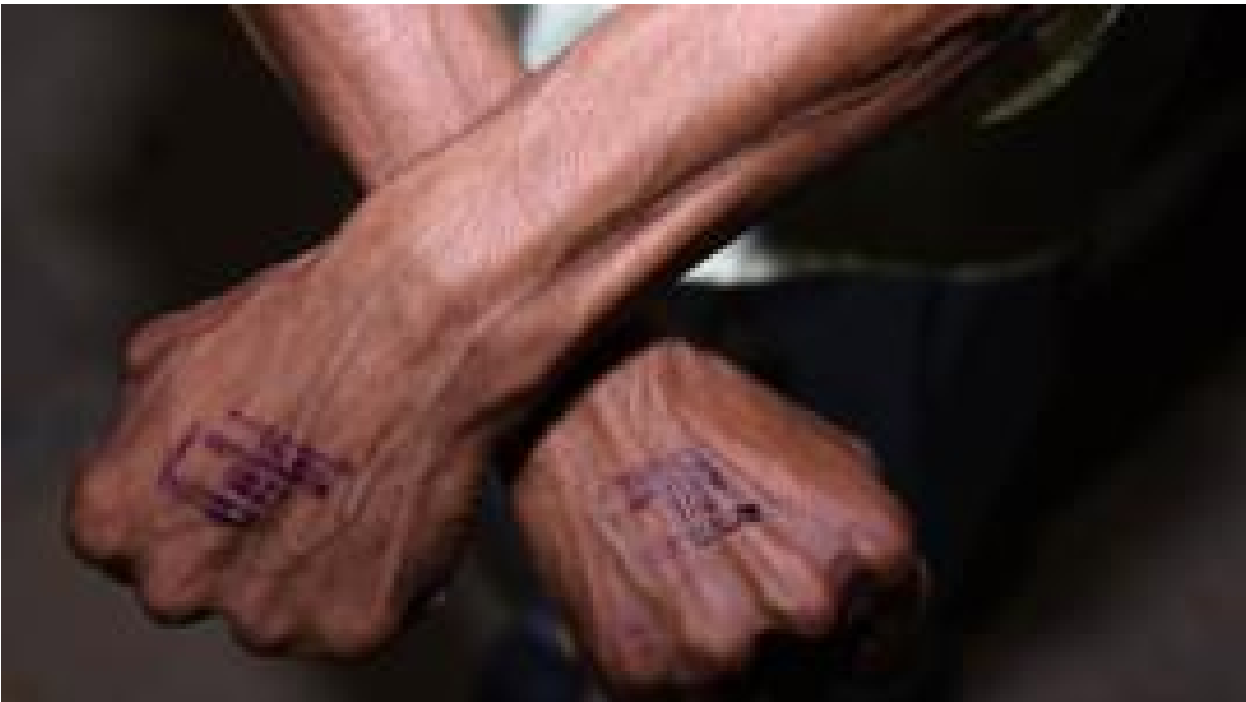
The families turned into 'zoo animals' by quarantine