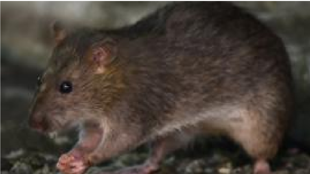
Why more rats are being spotted during lockdown