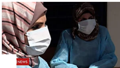
'Gaza has no resources to fight this virus'