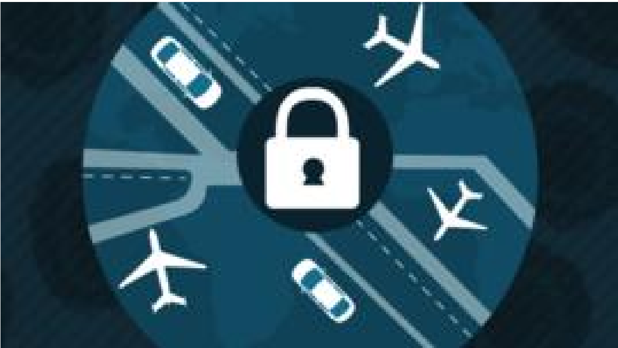
A visual guide to the world in lockdown