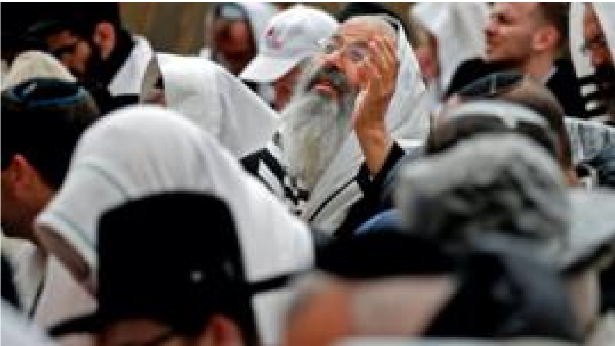
How coronavirus is changing religious festivals