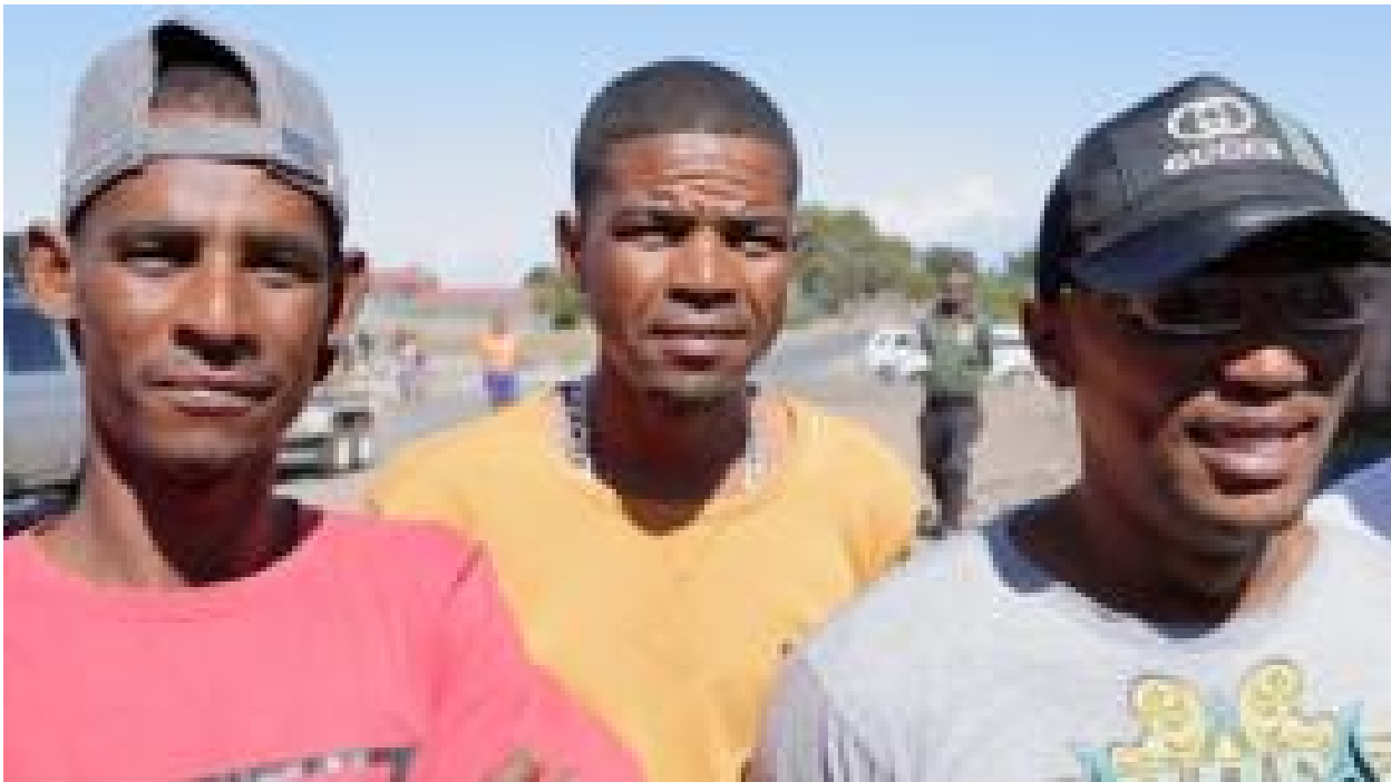
How coronavirus inspired a gangland truce