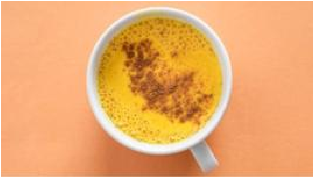
BBC Future: Can spices really benefit your health?