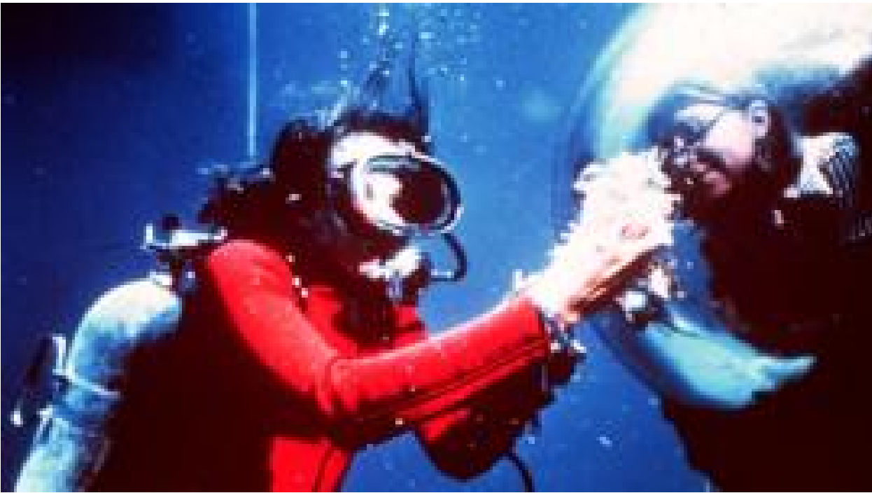
Nasa's all-female team of 'aquanauts'