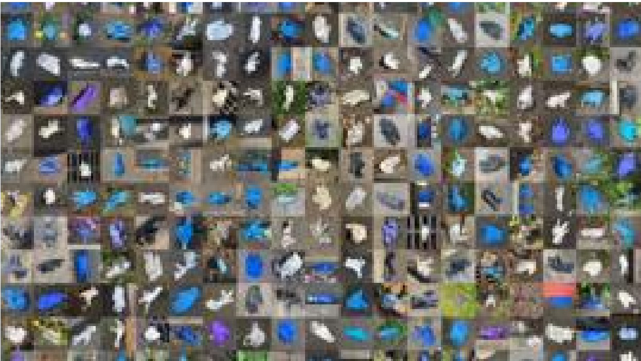
In pictures: Discarded disposable gloves