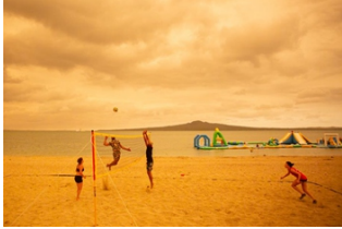
Xinhua photos of the day