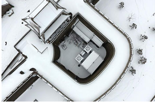
Snow scenery of Taiyuan Ancient County