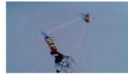
Xinhua selects aerial photos of the year 2019