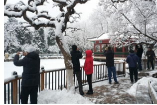
People visit Xuanwuyiyuan Garden after snow in Beijing