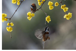
Wintersweet flowers seen in China's Jiangsu