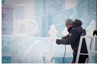
In pics: 34th Harbin Int'l Ice Sculpture Competition