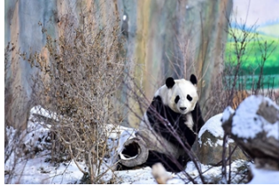
Giant pandas play in snow at Xining Panda House in NW China