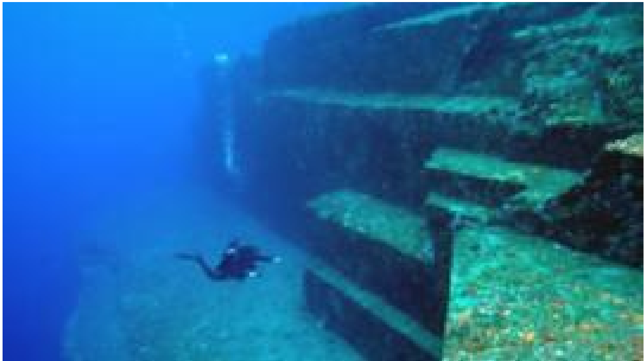
The truth behind Japan's mysterious 'Atlantis'