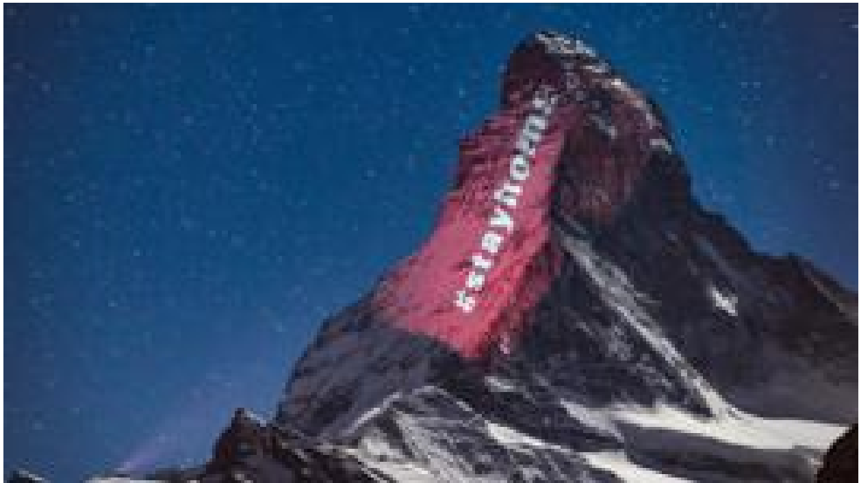
Week in pictures