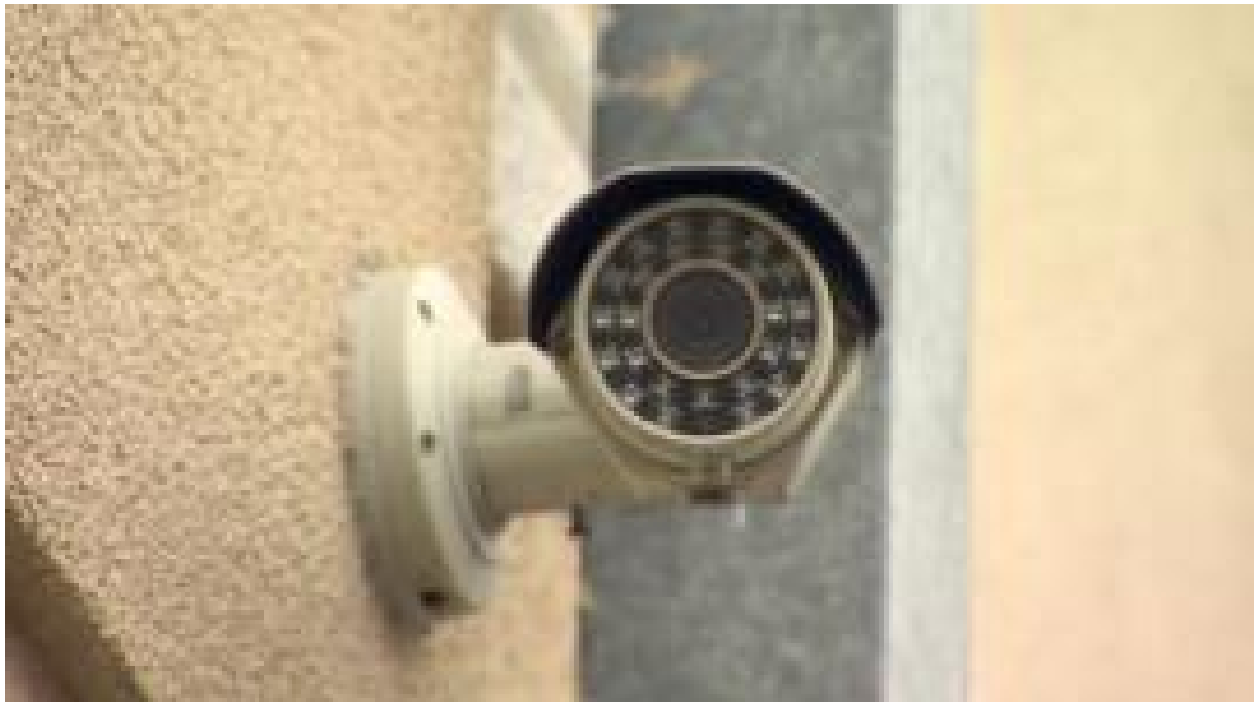
Russia uses facial recognition to tackle virus