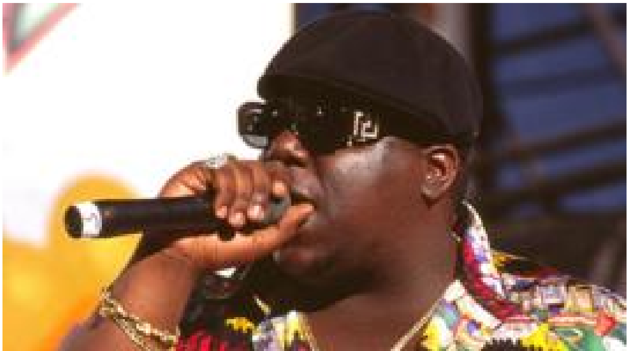
The big rap singalong that never happened