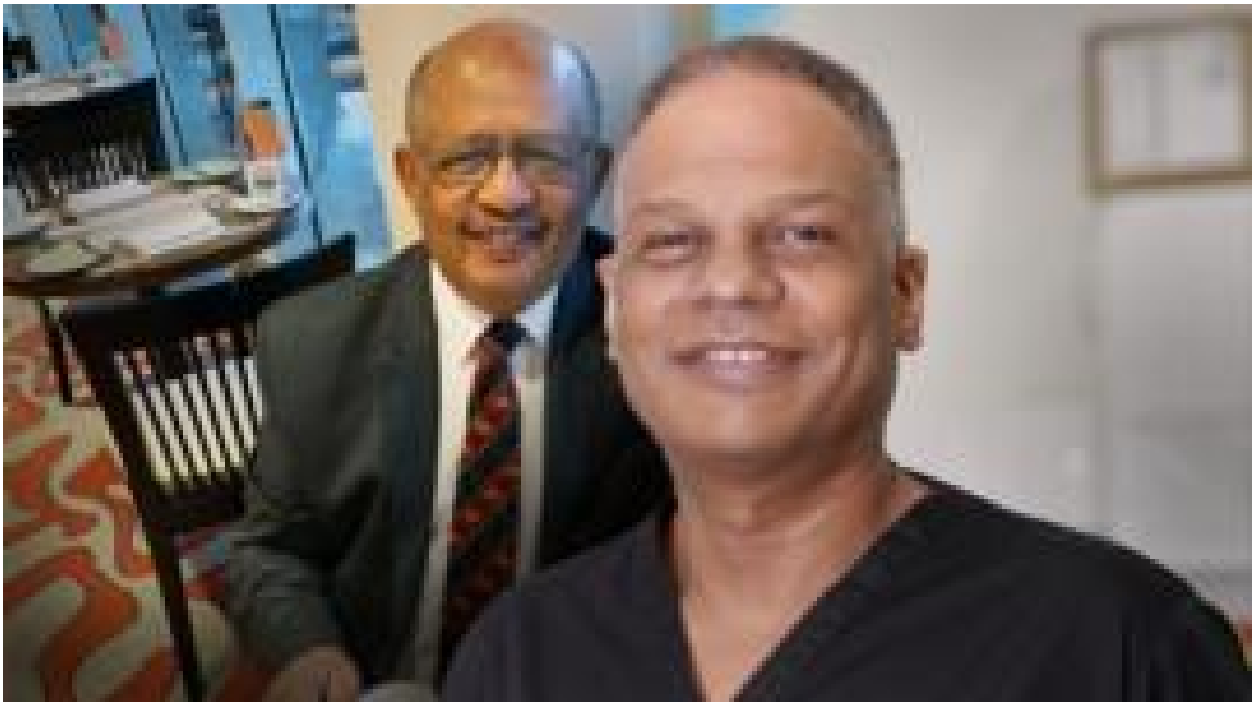
The Sudanese doctors who died in the UK