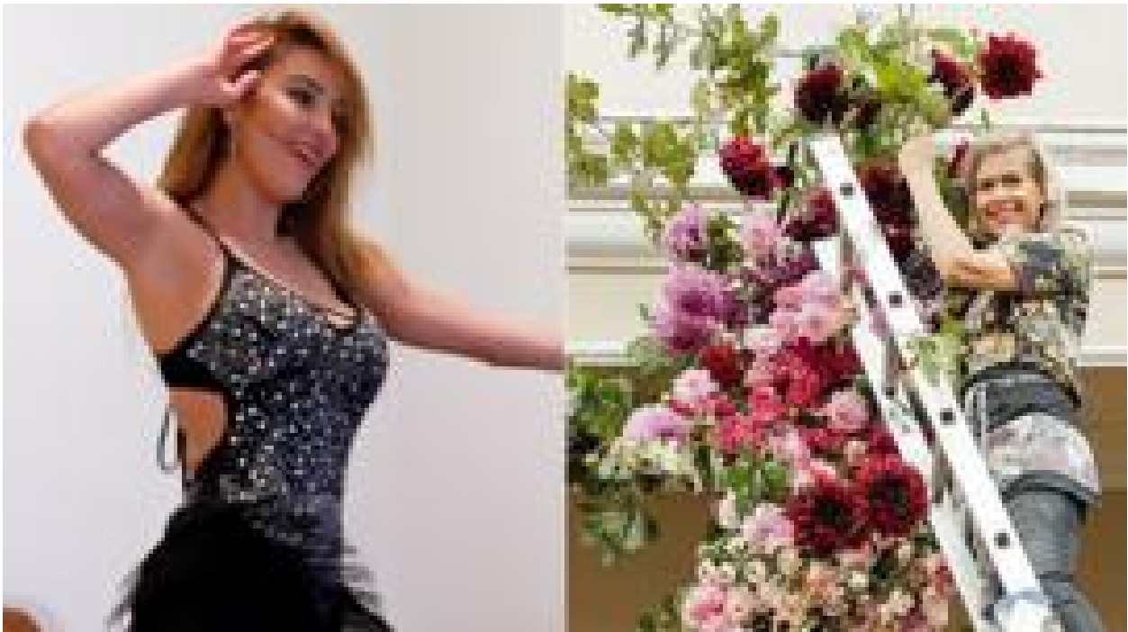
Belly dancers to florists: Six African coronavirus heroes