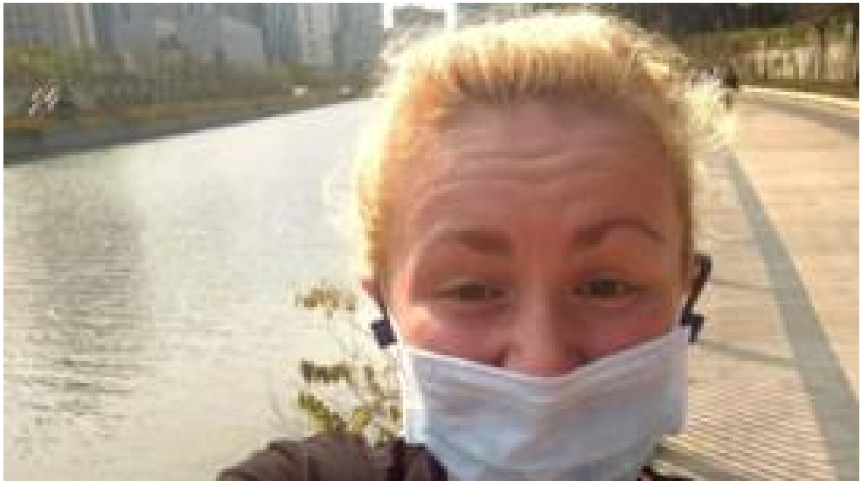
China: 'People have started leaving their houses again'