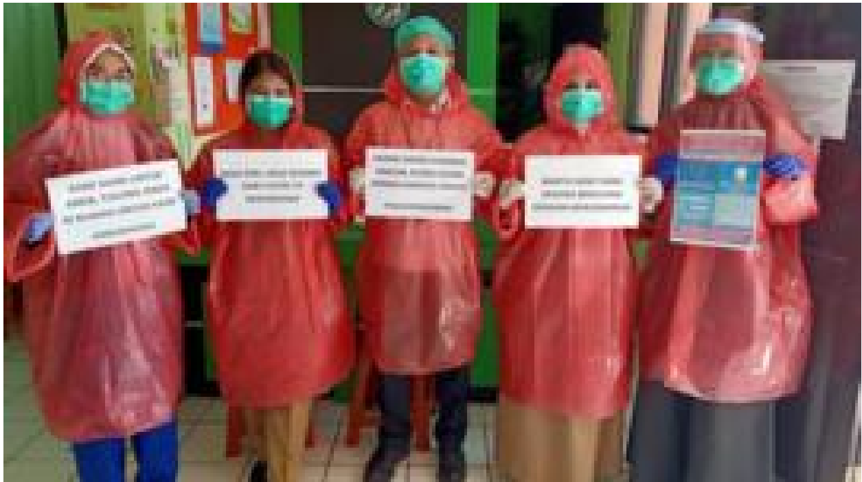
Indonesia grapples with fear of a hidden virus surge